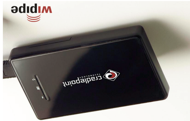
PHS300 Personal Hotspot